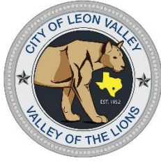
TABLE OF CONTENTS CANDIDATES FILING PACKET CITY COUNCIL ELECTION MAY 03, 2025