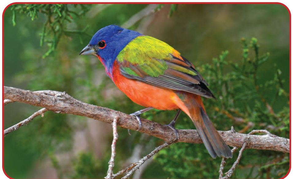
Painted Bunting.