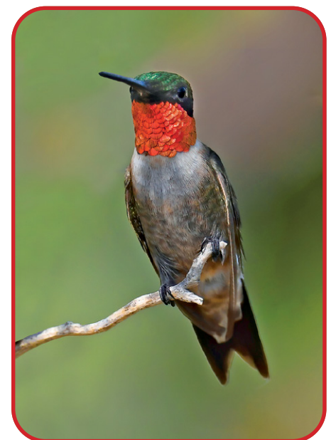
Ruby Throat Hummer