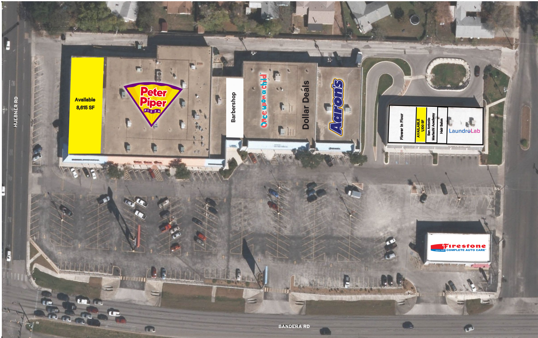
LEON VALLEY SHOPPING CENTER

© 2023 CBRE, Inc. All rights reserved. This information has been obtained from sources believed reliable, but has not been verified for accuracy or completeness. You should conduct a careful, independent investigation of the property and verify all information. Any reliance on this information is solely at your own risk. CBRE and the CBRE logo are service marks of CBRE, Inc. All other marks displayed on this document are the property of their respective owners, and the use of such logos does not imply any affiliation with or endorsement of CBRE. Photos herein are the property of their respective owners. Use of these images without the express written consent of the owner is prohibited.